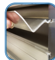
Removable Pan supports