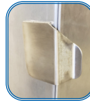
Gravity Latch Door Closure