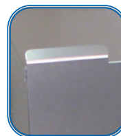
Integrated handle located on the top door edge